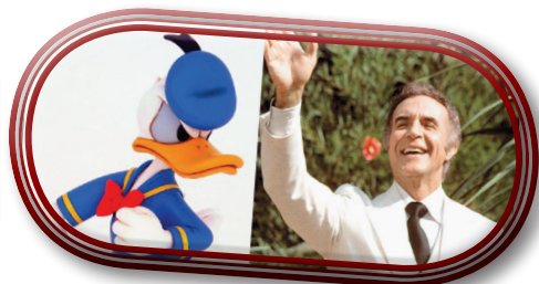
RICHARDO MONTALBAN Don Finlay