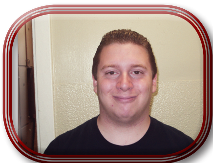
DR. SEUSS